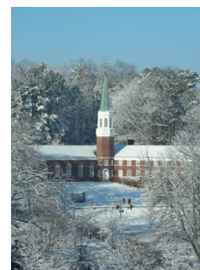
December 7, 2011

Hey Everyone! Yes, you! Let's Go Christmas Caroling on Sunday after church on December 18th! Bring your lunch and then we'll go out and sing the Good News! No reservations necessary.