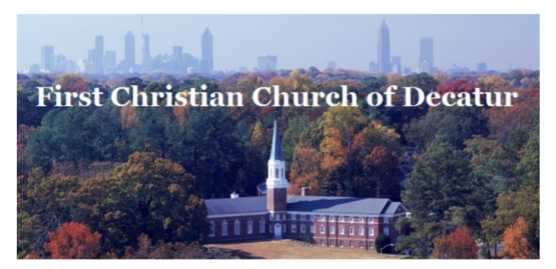
Resolve to Love – Agree to Differ – Unite to Serve – Break Bread Together

Decatur Disciples Newsletter Volume 52, Issue 19