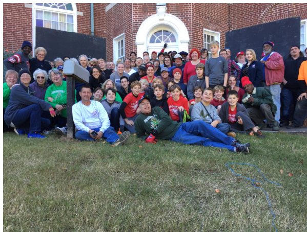
News and Notes for God's Folks

175 Church Members and City Neighbors Participate to Make the Christmas Tree/Wreath Sale a Successful Venture of Friend and Fund Raising; A Grateful Congregation Expresses Gratitude and Joy (and sighs of relief that we sold out in only nine days!)