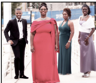
Concert on February 6, 2016 4 p.m. at First Christian Church of Decatur

Meeting - Sunday, January 24, 2016 after the Worship Service.